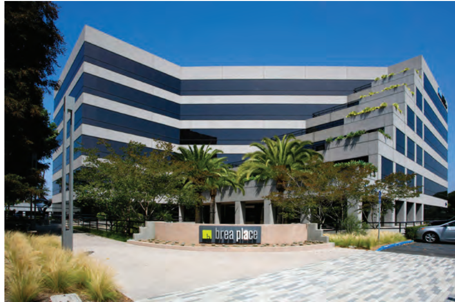
135 S. State College: Brea headquarters of No. 25 firm Frazer LLP, which experienced the steepest rankings drop on the list as its employment fell 23%

Overall, OC’s accounting and consulting firms employ 14,600 among 1,930 firms, the majority having fewer than 10 employees (see graphic, page 20).