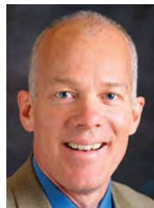
Weninger: ‘all positive’ area economic outlook boosted Moss Adams’ local office

“People think the economy is doing well, so we’re seeing a lot of new investments, whether it’s private equity or strategic buys. It’s all positive.”