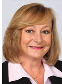
Hakes: ‘We are seeing an increase in the average loan size in the OC market.’

The biggest reason is because it has beefed up its staff to handle more loans,