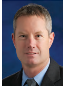
Doss: ‘Optimism is probably at its highest level since the recession.’

Both lists are based on data from the U.S. Small Business Administration. The