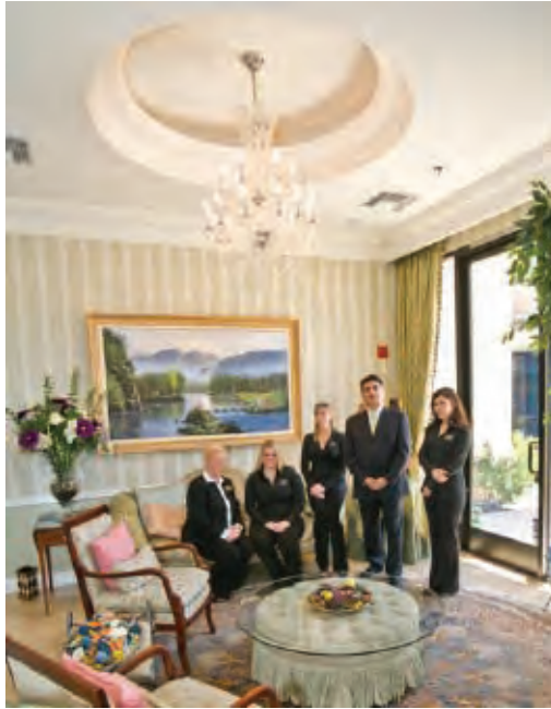
Five Star Palm Desert practice now open in Irvine

Appointments can be made by calling 949-789-0303 and by visiting online at www.cornerstonedentistry.com