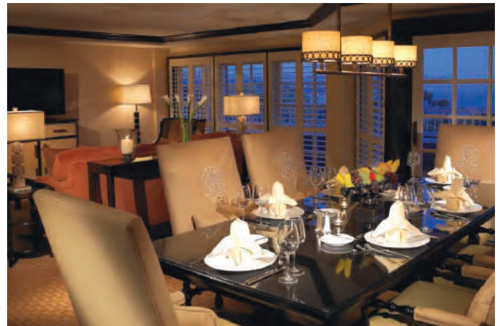
Laguna Cliffs Marriott Resort & Spa features luxurious renovated rooms and suites, most with ocean views.