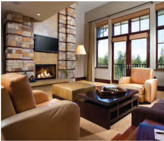
Comfortable surroundings of burnished leather, handsome woven rugs and the fieldstone and marble fireplace make the great room a perfect gathering place

Summers at 80150 Mammoth are just as addicting for our Owners. Hike, mountain bike, golf, swim, fish, hunt, climb, horseback ride and boat—the list of activities is nearly limitless. The only problem is there really aren't enough hours in the day.