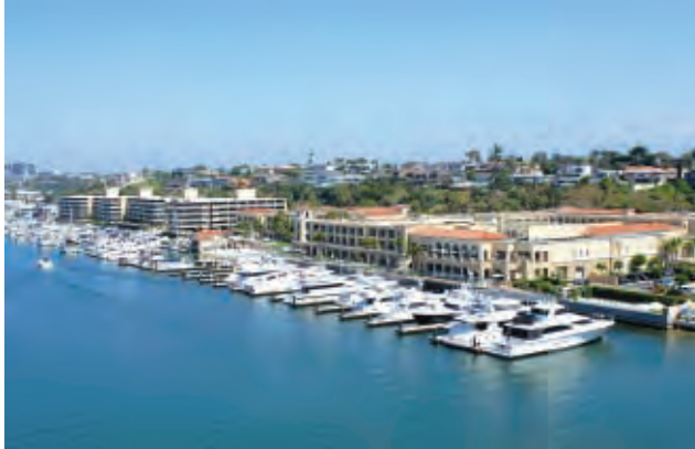
The Balboa Bay Club is the hub for social, corporate and association gatherings

Enjoy California-Continental cuisine as beautiful yachts sail by in this elegant waterfront dining room. The restaurant, famous for steaks and seafood, is also home to an award-winning wine list