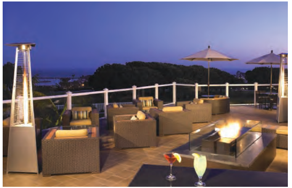
From the OverVue Deck, guests can enjoy stunning views of the Pacific Ocean