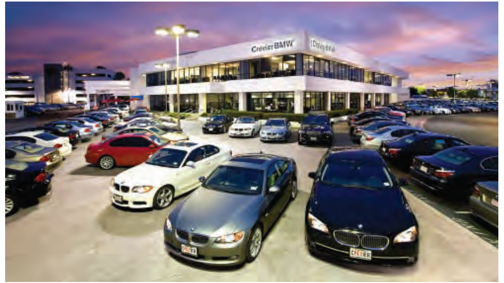
Crevier BMW is Orange County's choice for BMWs and the #1 selling BMW center in the Western United States

Crevier is conveniently located at 1500 Auto Mall Drive in the Santa Ana Auto Mall, just minutes from John Wayne Airport. Be among the first to drive Crevier's newest arrivals. Call 714-835-3171 today and schedule a personal introduction and test drive or visit our website at crevierbmw.com.