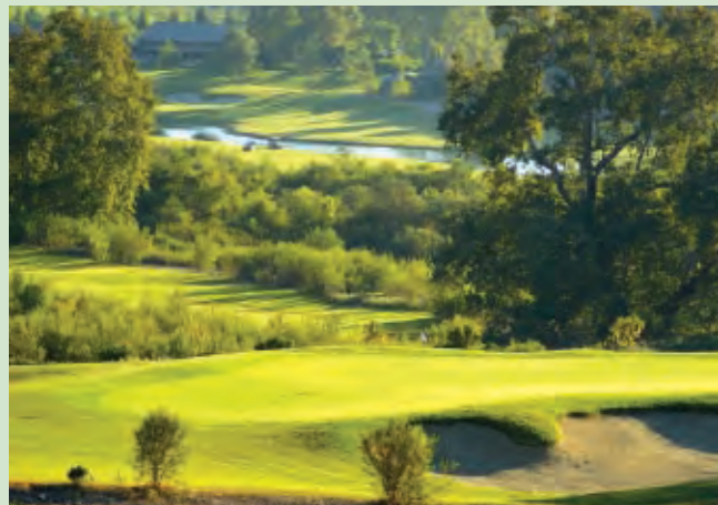
Arroyo Trabuco Golf Club, proudly celebrating five years, offers golfers a high-end experience without the high-end price.

For more information contact the club at 949-305-5100 or visit their website at www.arroyotrabuco.com