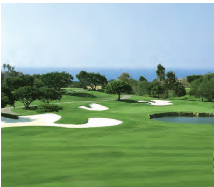
As evidenced in this view of the 18th hole, few golf experiences can match the blend of stunning natural beauty and variety of challenges presented at Monarch Beach Golf Links

Landscaped nature trails, accessible by resort tram only, lead to a 6.1-acre beach with exclusive access to the Monarch Bay Club, a private beach club. The Beach Club is situated directly on one of the best and most exclusive beaches in Southern California. Registered guests of the St. Regis Monarch Beach are able to enjoy food and beverage facilities and other beach activities by calling their "Beach Butlers," or if personalized surfing lessons are on the agenda, call a "Surf Butler!"