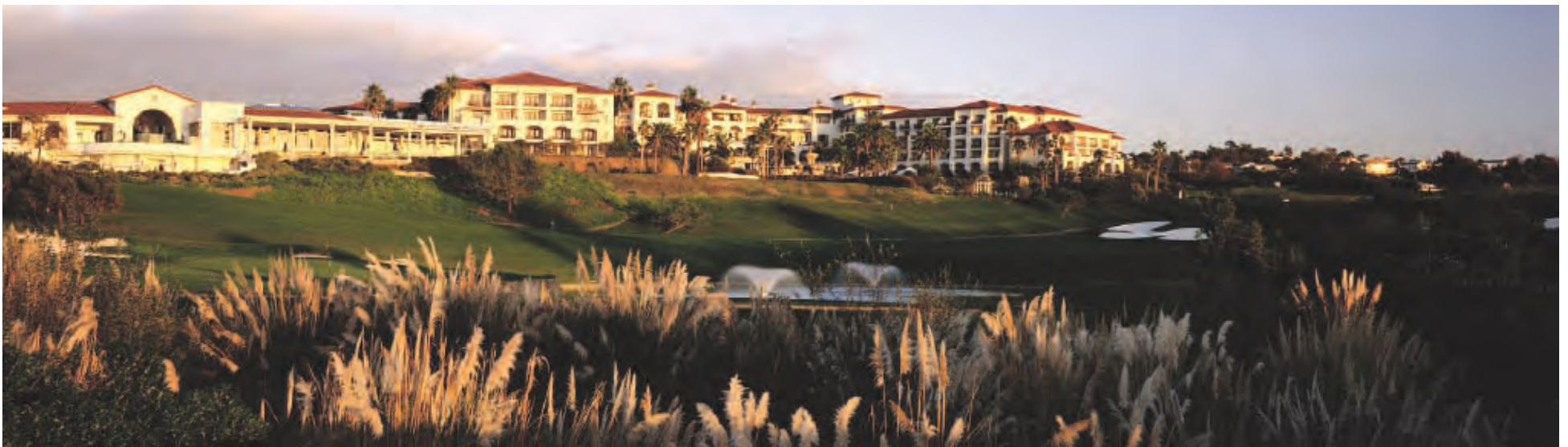
Each of the 400 Guest Rooms at the St. Regis Monarch Beach offers incredible Pacific Ocean and golf course views