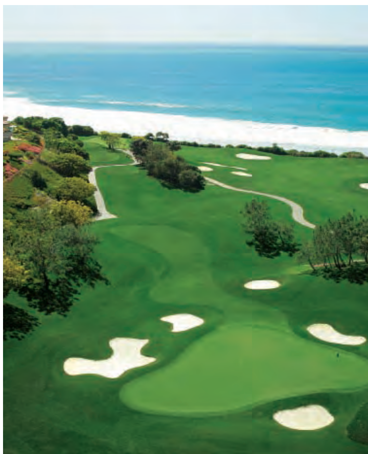
Deep bunkers flank a large green on hole #4

Spacious guest rooms with gorgeous views, an exclusive beach club with "Surf Butlers," and award-winning Spa Gaucin, six ocean-view restaurants and on-site championship Monarch Beach Golf Links are just some of the reasons to visit the St. Regis Monarch Beach.