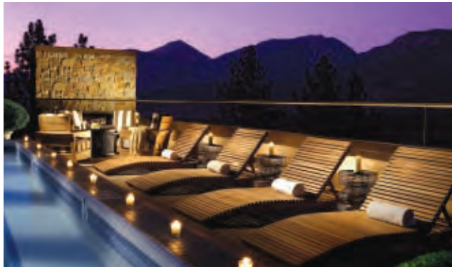
An aerie at the top of 80150 Mammoth, the Owners' Rooftop Lounge and Spa is a stunning sanctuary for Owners. Tranquil. Scenic. Peaceful. Fun.

But there is plenty of sunshine—an average of more than 300 days a year.