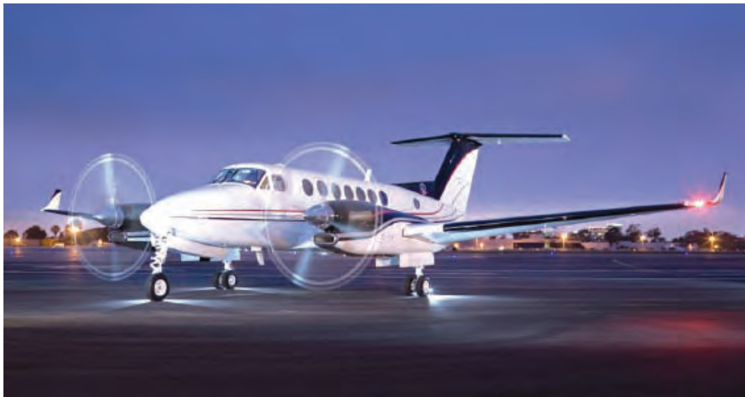
West Coast's King Air 350

This program provides Owners with a turnkey flight department that manages maintenance, flight crews, operations, and administration and ensures quality, convenience, safety, service and dependability at a low cost. And, unlike many fractional programs, owners fly in familiar aircraft with familiar flight crews.