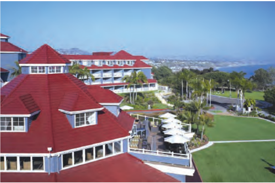
Spectacular coastal view of Dana Point from the newly renovated Laguna Cliffs Marriott Resort & Spa.