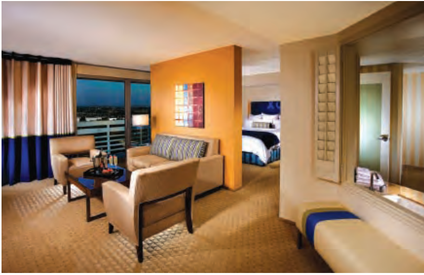
High-style rooms offer plush bedding and spa-chic amenities that will delight any guest