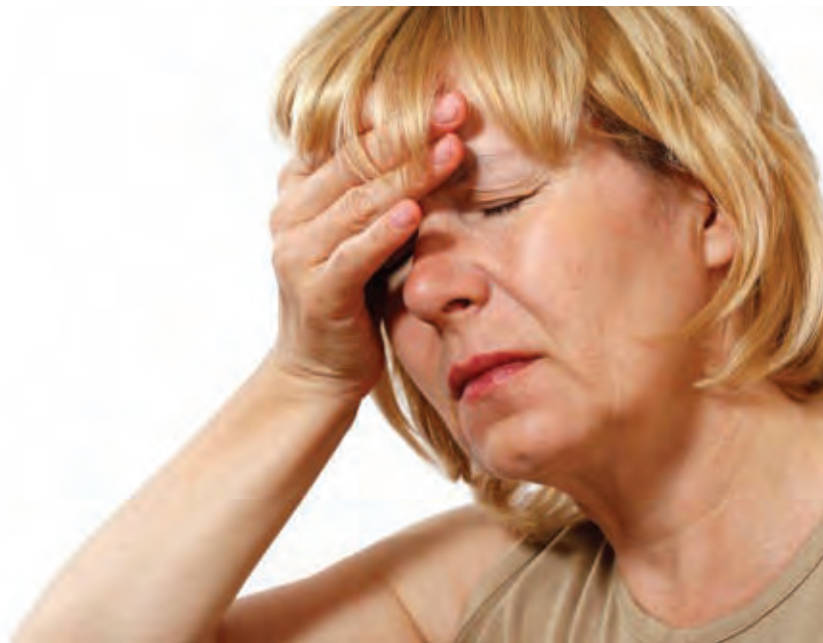
Dry eyes are common in women over forty due to hormonal changes