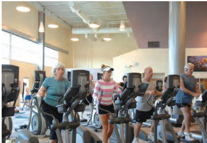
St. Joseph Health System employees work out at its Wellness Center, which provides programs and services that focus on the continuum of care from wellness to prevention to health maintenance

It all starts at the top when it comes to creating a work environment of wellness and health improvement. Experts in employee health management state that the success of an organization's efforts in creating cost savings and value from their worksite health promotion initiatives lay directly on the health and wellness commitment of senior leadership. We also know that executive health and employee health go hand and hand. Organizations that manage to