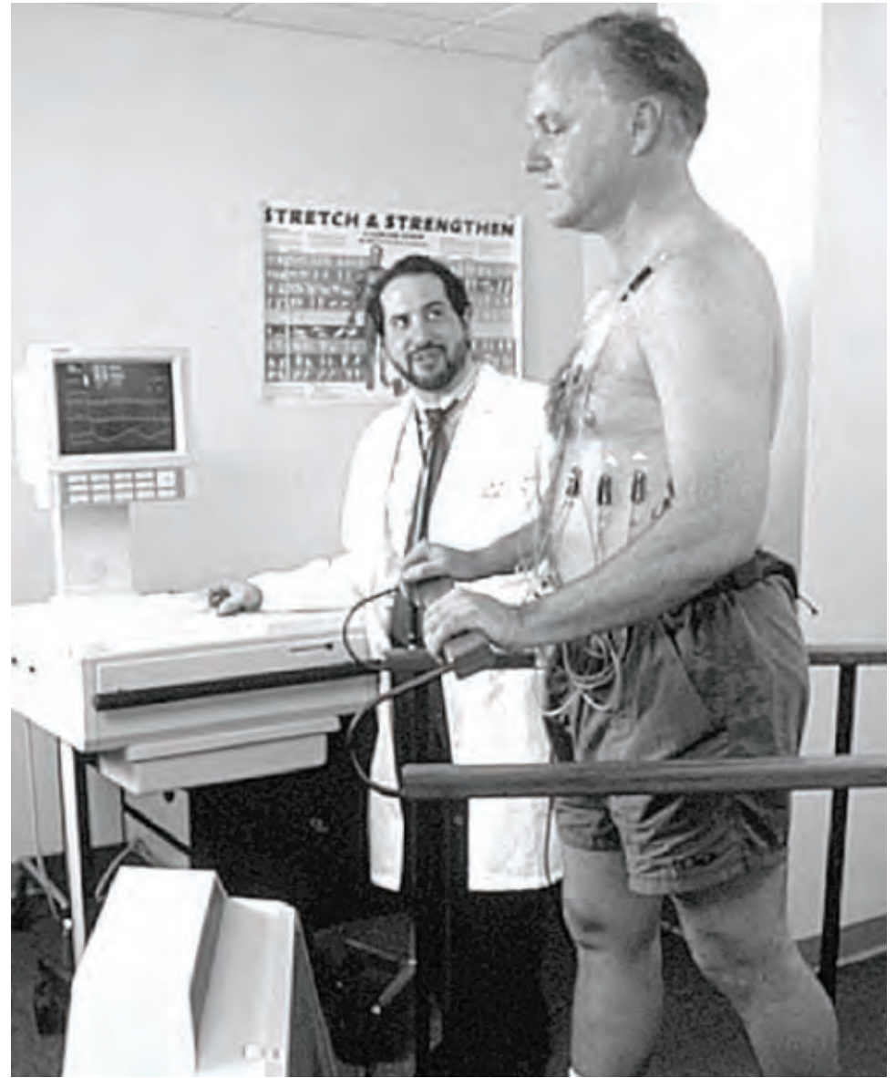
The UC Irvine Executive Health Physical is designed to be efficient while providing time for an in-depth discussion between patient and doctor.

For information about UC Irvine’s Executive Health Program, please call 949.824.8033.