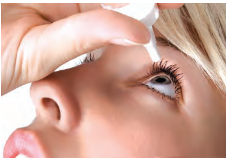
Prescription eye drops is one of the treatments for dry eyes

NVISION Laser Eye Centers offers both diagnosis and treatment of a variety of dry eye