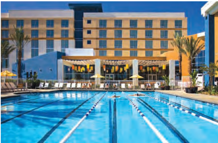
Renaissance ClubSport's Junior Olympic pool, exercise pool, and children's splash and play area are perfect for every water activity