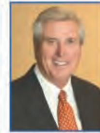
Ski Harrison Rutan & Tucker LLP