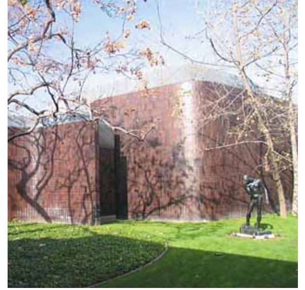
From left: Griffith Observatory, the Hollywood Walk of Fame, Norton Simon Museum

L os Angeles County has no shortage of fun weekend or staycation activities. Below, in no special order, is a list of suggestions we collected from various locals who weighed in on their favorite places to take themselves, their kids or out of town guests.