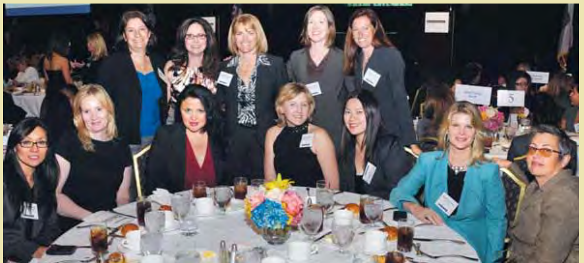
The Los Angeles Business Journal's Women Making a Difference event, held at the Hyatt Regency Century Plaza, was attended by over 475 local business leaders.